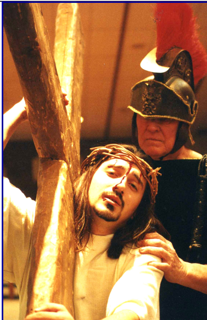
Jesus, as He stumbled carrying the Cross through Jerusalem, was assisted by a Centurion.

“This involved our raising over $150,000 and recruiting our members to help with the actual renovations to keep the cost down. Over 100 volunteers spent hours, painting, sanding, recovering